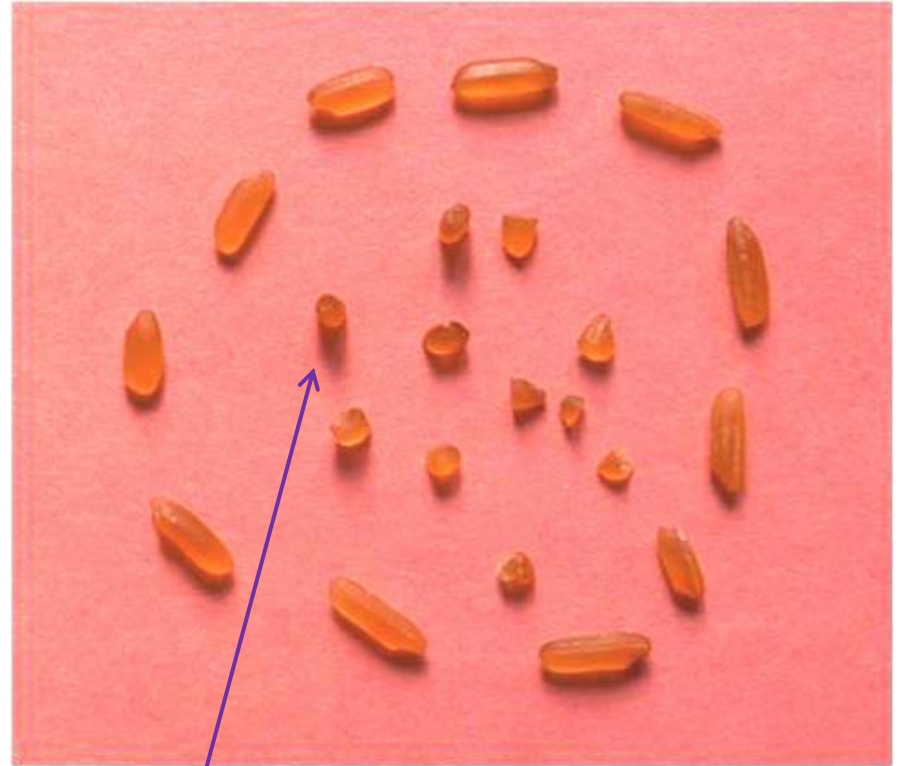
Transverse section of Damaged grain