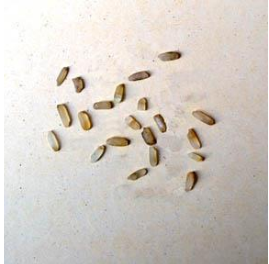
Slightly Damaged Grains