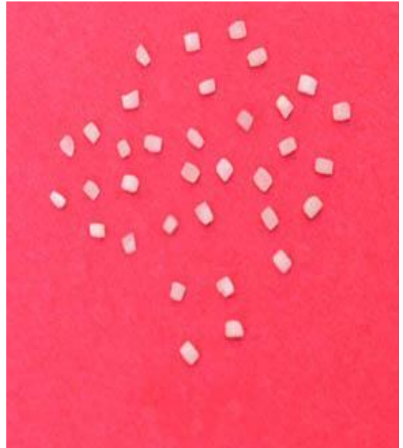
Small Broken Grains