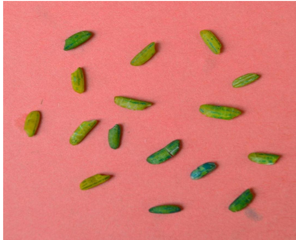
Dehusked Grains after Methylene Blue & Metanil Yellow treatment