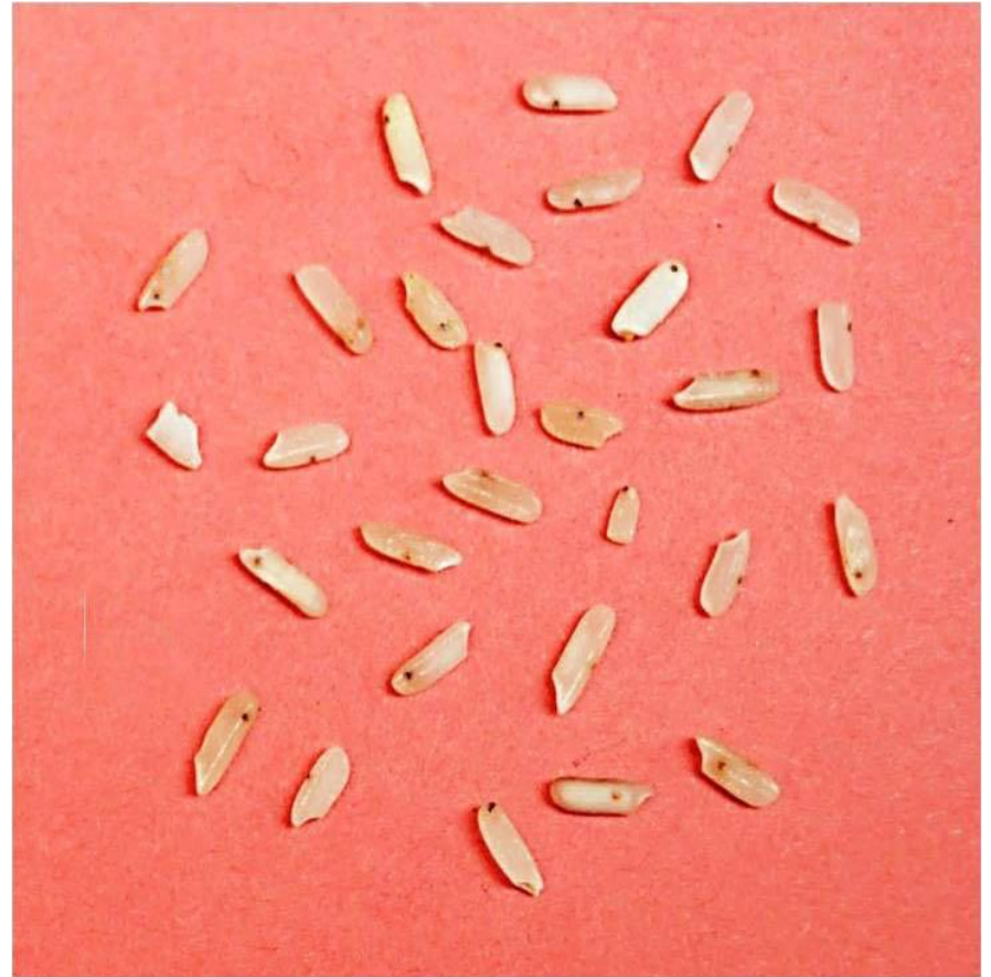
Pin Point Damaged Grains