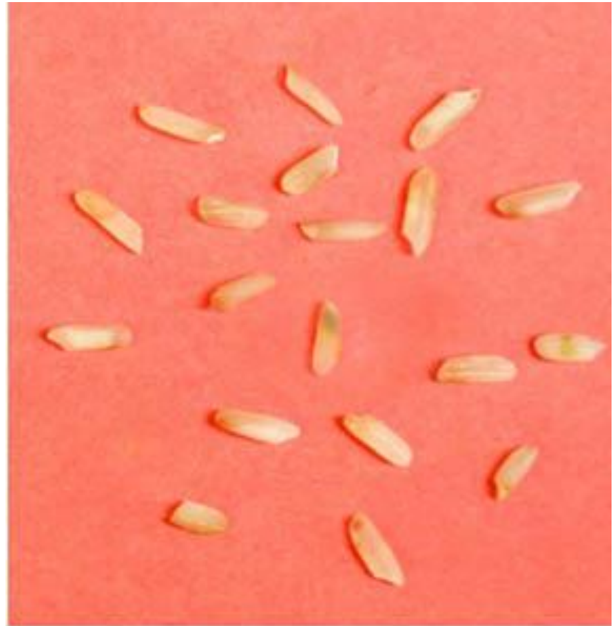
Slightly Damaged /Touched Grains