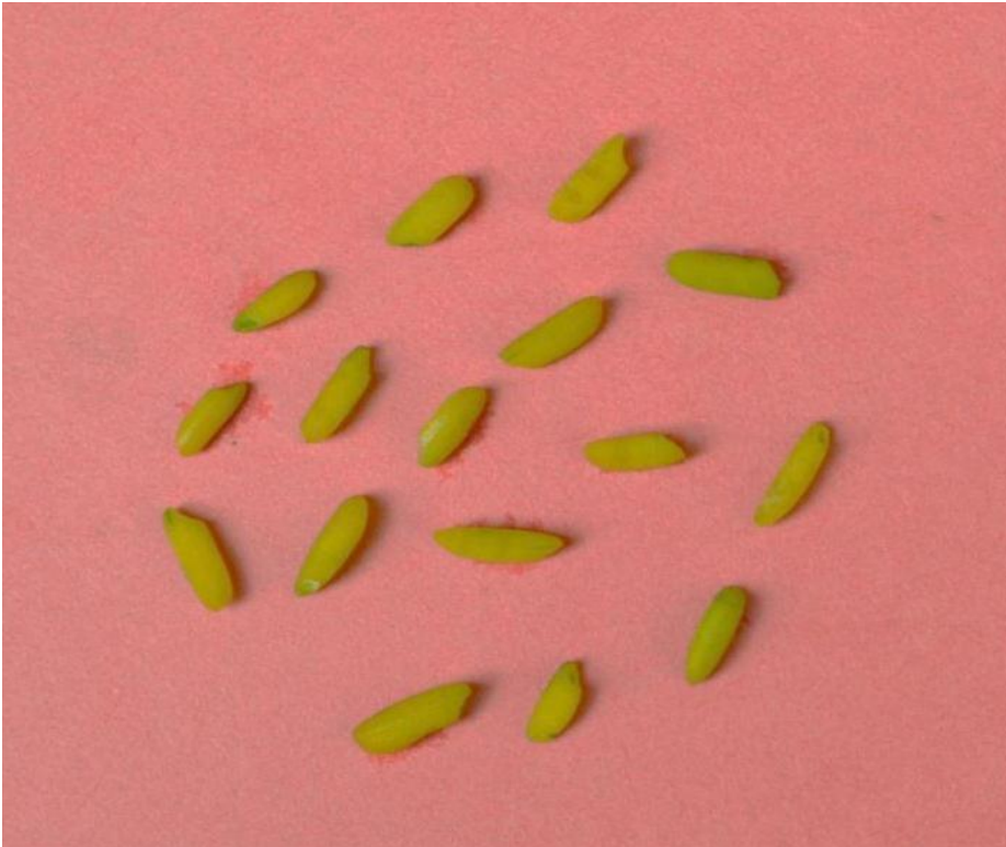
Sound Grains after Methylene Blue & Metanil Yellow treatment